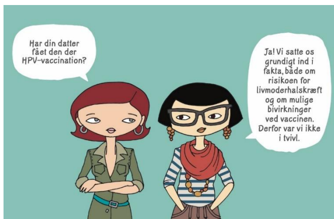
Illustration from the HPV information campaign Stop HPV – stop livmoderhalskræft ( Stop HPV – stop cervical cancer )

In 2018, there was again focus on the provision of information about HPV immunization and on increasing coverage. The HPV information campaign Stop HPV – stop livmoderhalskræft ( Stop HPV – stop cervical cancer ) continued in 2018 with its own website, Facebook page and information material for parents and healthcare professionals. The campaign has contributed to more parents agreeing to have their daughters vaccinated.